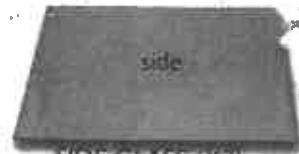
SIDE GLASS (X2)