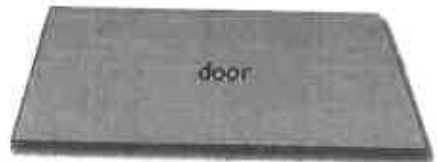
GLASS DOOR (X2)