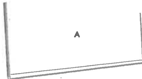
BOTTOM PANEL (X1)