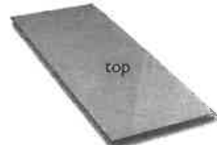
TOP GLASS (X1)